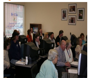
Clients in a training class at the ACCORD

Rochester, NY (585) 325 6530 Washington Heights-Inwood Development Corporation New York, NY (212) 795 1600 Women’s Enterprise Development Corporation Inc. White Plains, NY (914) 948 6098 Worker Ownership Resource Center/IBERO Elmira, NY (607) 737 5212