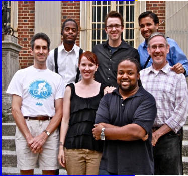
CAMBA's graduating EAP class of June 2010.

CAMBA has been around since 1977. Originally standing for Church Avenue Merchants Block Association, CAMBA now simply represents, "Where You Can." The Brooklyn-based nonprofit organization offers integrated services and programs in: Economic Development, Education & Youth Development, Family Support Services, HIV/AIDS Services, Housing Services & Development, and Legal Services.